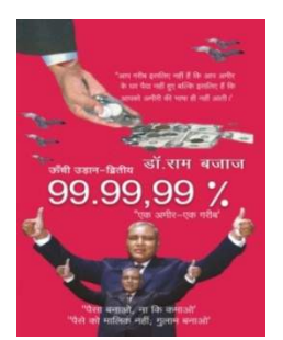
99.99,99% एक अमीर एक गरीब