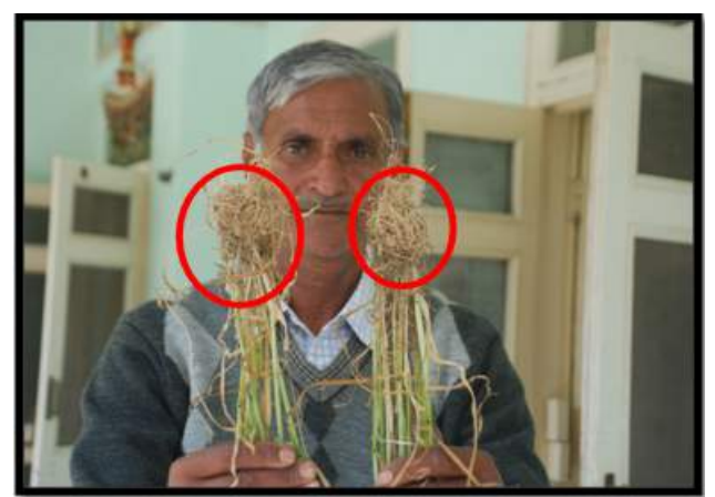
Showing the symbiotic interaction between two or more (seven plants) non-legume wheat crops & symbiotic friendly developments of roots between two or more (seven plants) plants, not only boost plant nutrition, but increase the number of spikes & number of grains in wheat's spikes as well as height & biological yield. Plant height = 120cm to 100cm, spikes M^{-2} = 600 to 650 spikes & No. of grains per spikes = 45 to 52 grains/spikes.