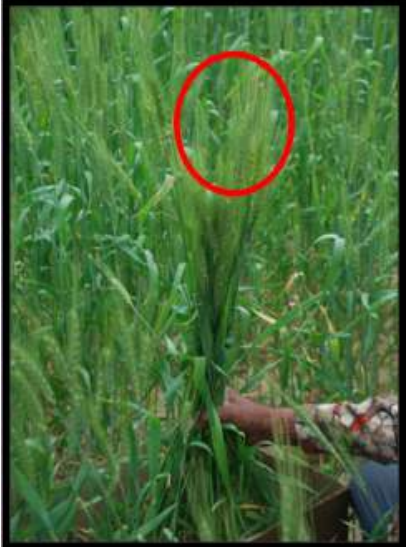
Standing crops: Height = 120cm to 100cm & No. of spikes per sq.ft. = 60 to 65 spikes